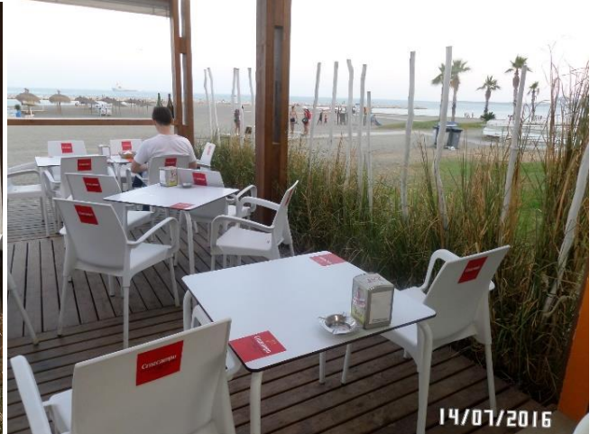
Plants reaching 1.6m height before trimming back and view from inside the restaurant