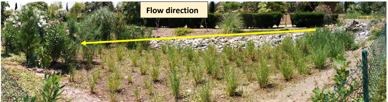
Growth gradually reduced as water moved down the drain from inlet