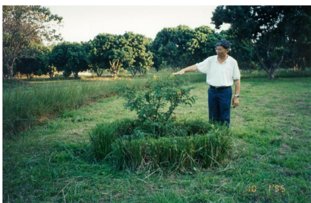
With vetiver planting

• The first comes to my mind is soil pathogen such as nematodes, a soil born microscopic worms that infect the roots and severely affected plant growth. This infestation is very common in old orchards, it may occur on this very old olive plantation. The following photos show the effects of nematode infestation on Sweet Tamarin in Thailand. Due to this infestation, planting vetiver around orchard trees is a very common practice in Thailand now.