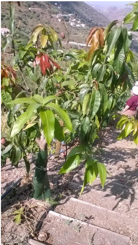
New mango and new avocado planting between vetiver rows