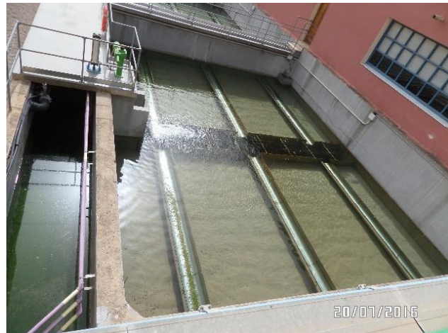
Water quality before and after VPT treatment