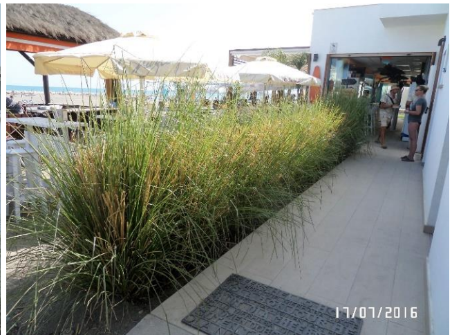
Planting outside the toilet block for screening and this was occasional watered by kitchen wastewater, so it is very flush as compared with planting on the other side, reaching over 1.8m