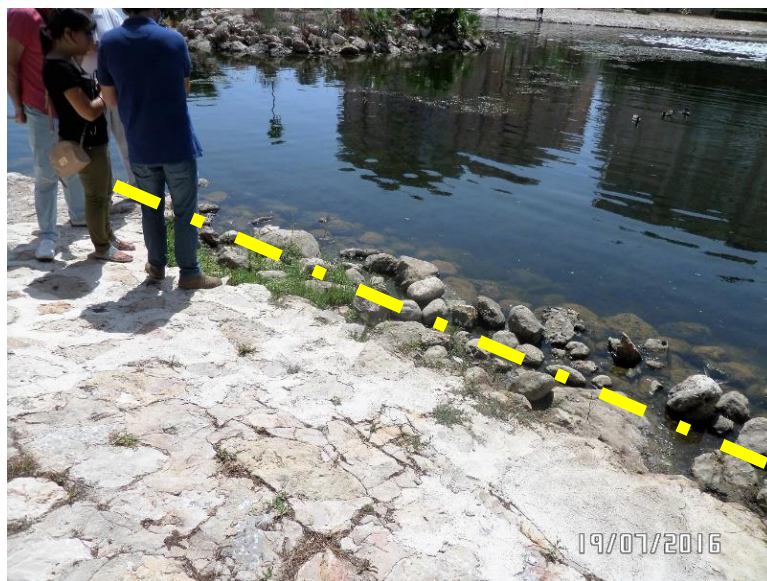
Planting on the water edge