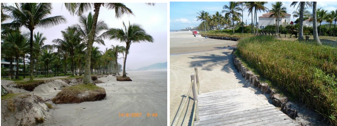
Beach erosion and restoration with vetiver on Sao Paolo beach, Brazil

I also noticed some erosions in Andalusia, Valencia and Barcelona beaches, where restoration like this on Sao Paolo beach in Brazil can be applied.