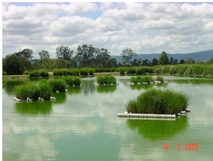
Floating pontoons on an effluent pond in Australia

The proposed system consists of: 1) Floating pontoons on the lake, 2) Vetiver planting directly to shallow areas near runoff inlets and 3) Selected locations around the water edges