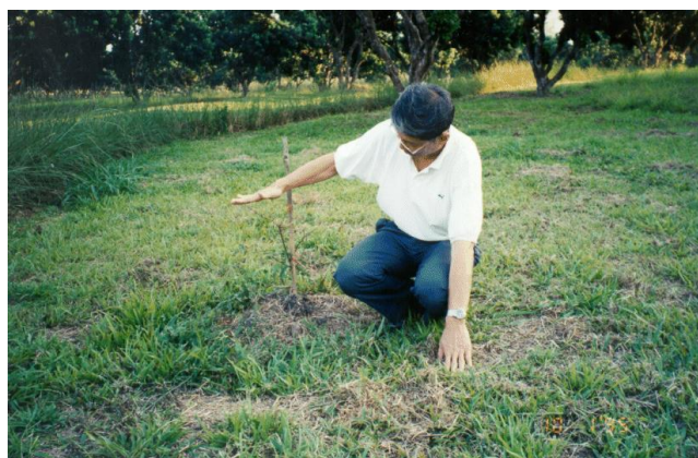
Without vetiver planting

• The second possibility is some fungal diseases infected the roots, so I suggest a soil pathology test to be conducted on various soils in the farm and garden