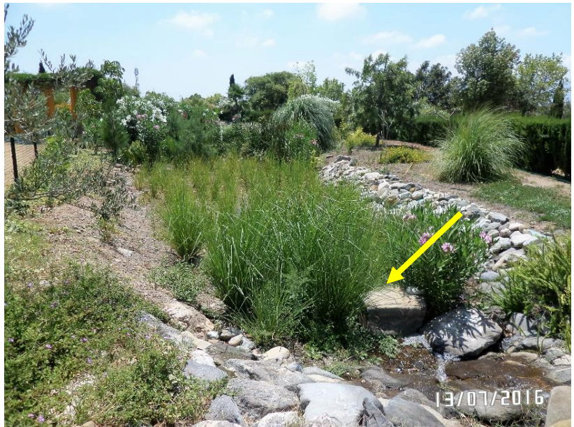
Better growth at outlet of water to top end of drain from "Fountain" wetland