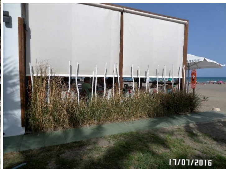
Eight month old planting on the on the side of the restaurant