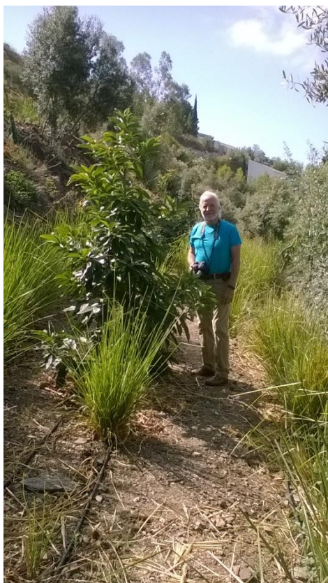
Two year old avocado tree with its first fruits

The most remarkable outcome of vetiver planting on the farm is its effect on horticulture crops such as avocados, citrus, olive and mango. Anna and David attribute this to soil and water conservation. The following photos show a very well developed two year olds avocado with its first fruits. This is not for this single plant but on all avocados planted between vetiver rows. This effect was most remarkable when it also “rejuvenated” old olive trees and also observed on new mango crop.