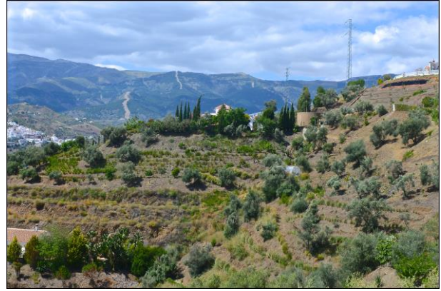
Original erosion situation on the farm Erosion under control today, 5 years later

The followings are some of their results and experience: