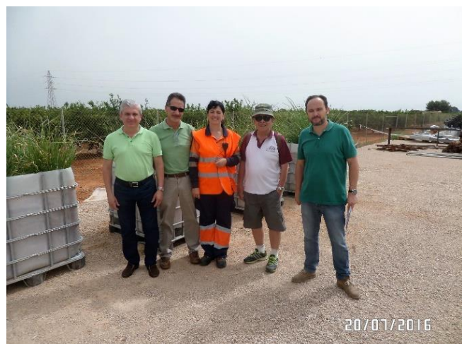
Management and monitoring team