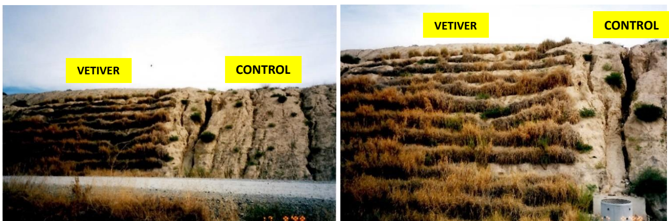
Four years after planting. Contrast between vetiver and control plots at Lorca site. No natural colonisation of native plants.