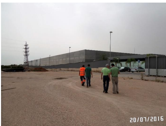
Indoor fresh solid waste treatment plant

Under Spanish law, landfill site near populated areas has to be treated indoor, at this site, leachate is extracted and carted to wastewater treatment plants. The company is interested in using Vetiver to treat the leachate on ground similar to the process conducted in Australia and the USA. As the leachate is highly concentrated with salt, a container trial is being set up to test vetiver tolerance to salinity levels as well as its water consumption over the whole year.