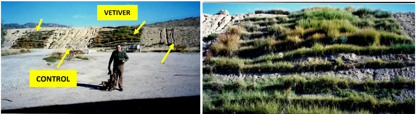
Three years after planting at LORCA in 1997, Vetiver established well with drip irrigation during establishment phase (the first summer) and no further irrigation