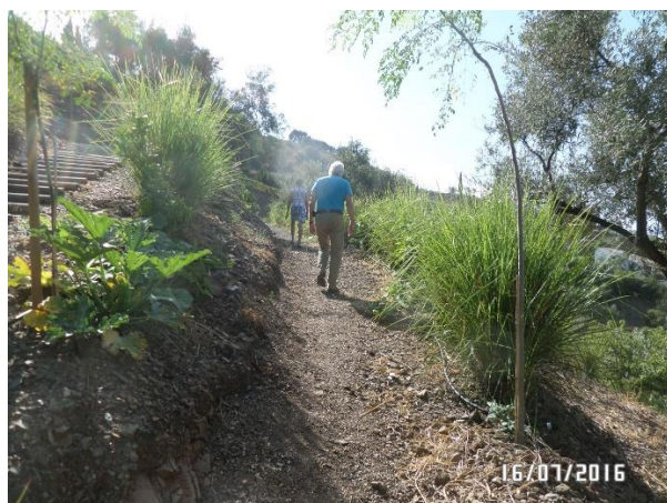
General vetiver planting for various applications on Vetiverspain farm