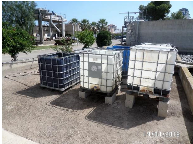
Tavernes de la Valldigna Sewage Treatment Plant and containers set up for the trial