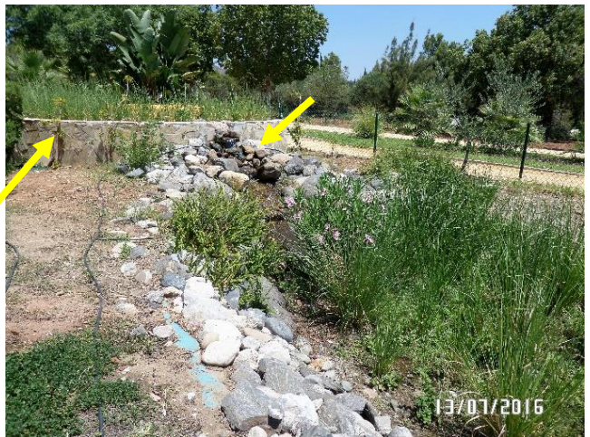
Fountain wetland and outlet into lower wetland