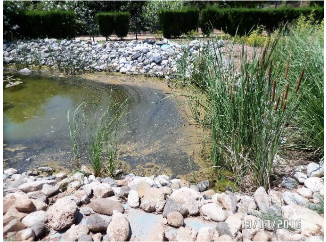
Polluted water in the collecting pond