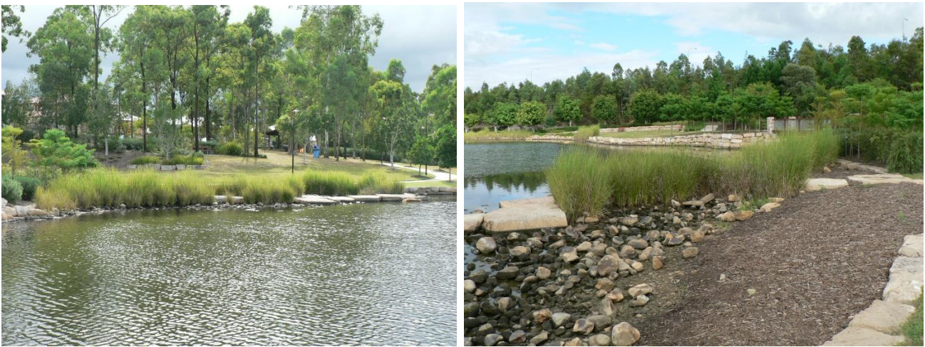
Planting in shallow pool on Springfield lake in Australia