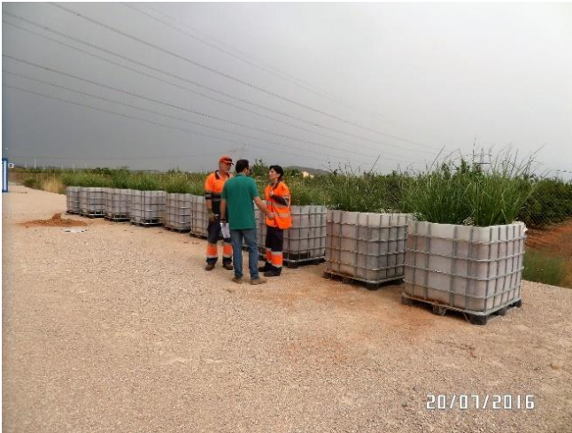
Trial set up with 9 containers