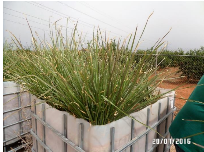
3 month old vetiver ready for testing

Due to high salt content of leachate (17,600 uS/cm), the treatments will have 50%, 30% and 20% of pure leachate concentration.